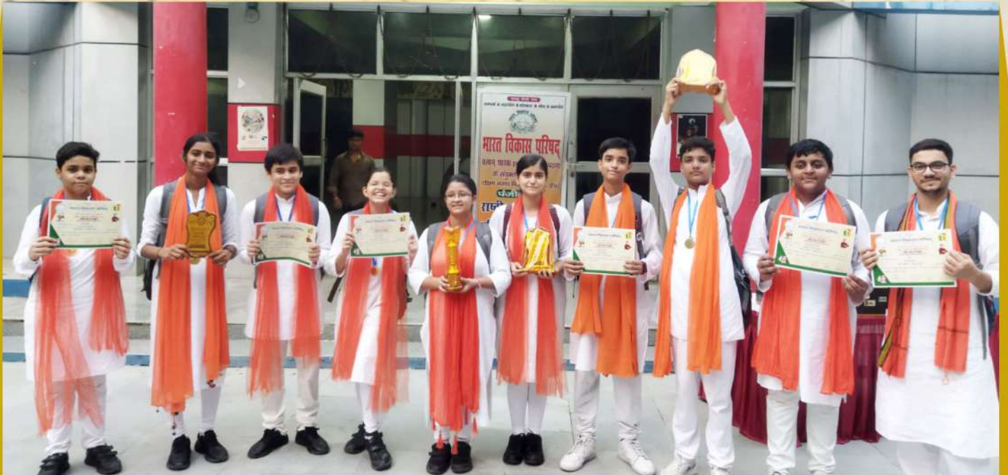
Our students secured the Runner Up Trophy with their soul-stirring performance in Sanskrit, Hindi and Maithili Folk Songs respectively.

"Music expresses that which cannot be said and on which it is impossible to be silent."