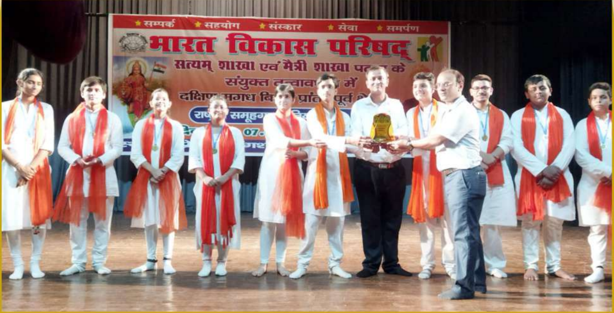
The victorious team with their group leader receiving the garlands, prizes, citation and medals.