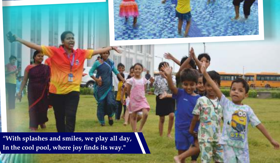
"With splashes and smiles, we play all day, In the cool pool, where joy finds its way."