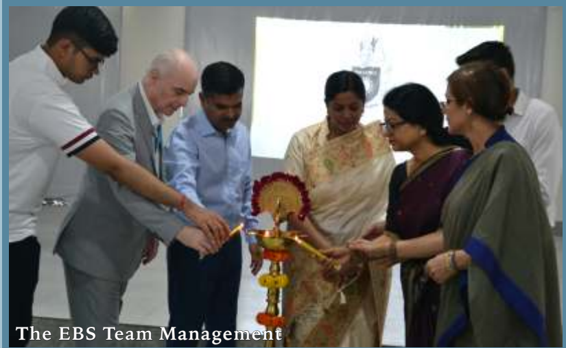
The EBS Team Management