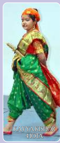
KAVYA KISHOR 4IOTA