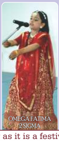
OMEGA FATIMA 2SIGMA