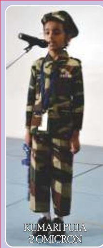
Kumari Puja 2 Omicron