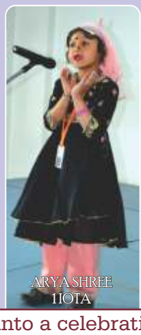
ARYA SHREE 1IOTA