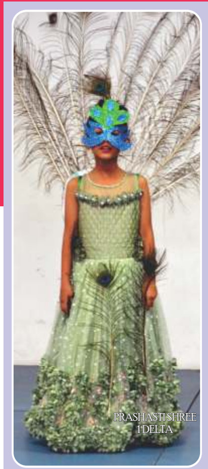
PRASHASTI SHREE 1 DELTA