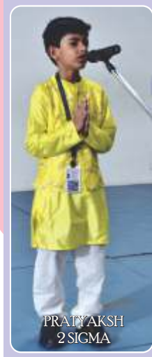
PRATYAKSH 2 SIGMA