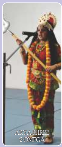
ARYA SHREE 2OMEGA