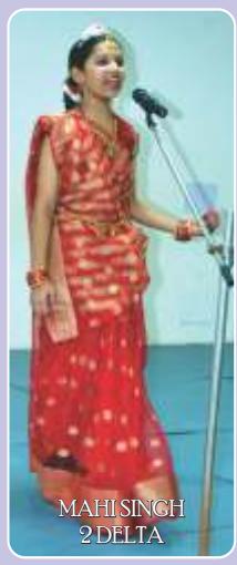
MAHISINGH 2 DELTA