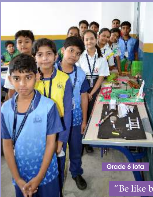
Grade 6 Iota