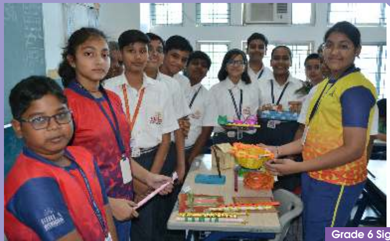
Grade 6 Sigma

It may need to be perfected through practice and patience, but the effort dedicated to it change us as a human, making a better version out of it. The kids of OMK understand it very well. Therefore, they decided to showcase their skills through carving objects from bamboo parts. It was a pure joy to see the little artists at work.