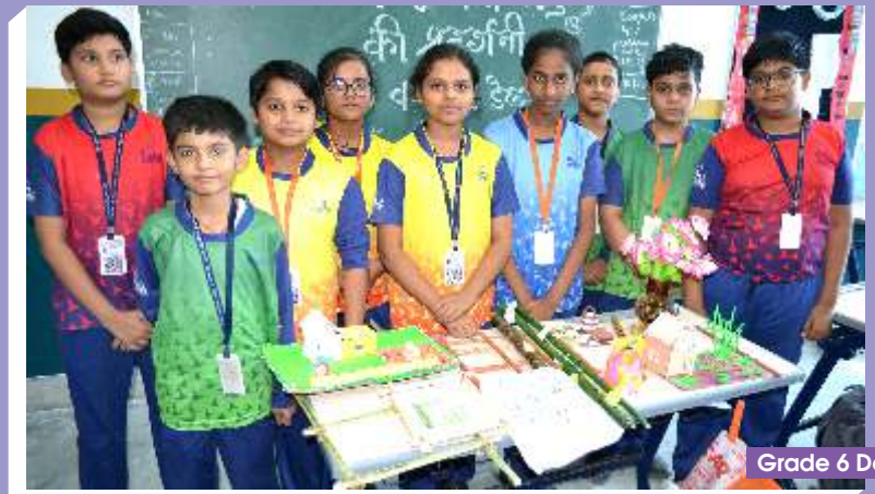
Grade 6 Delta