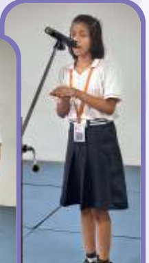
ANIKA 5 DELTA