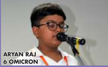
ARYAN RAJ 6 OMICRON