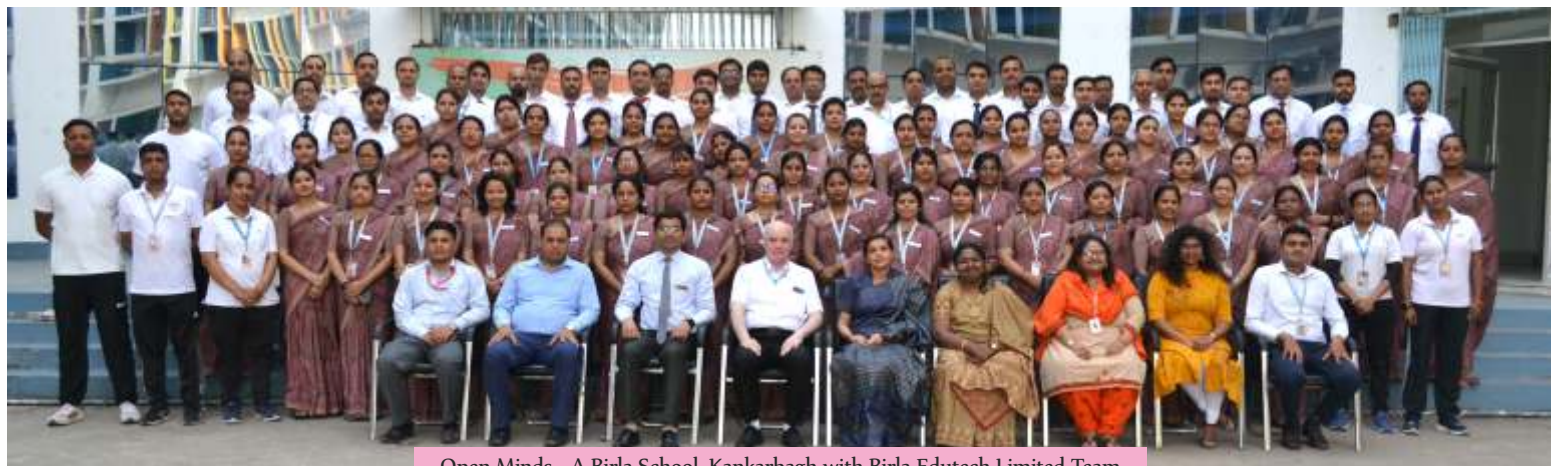
Open Minds - A Birla School, Kankarbagh with Birla Edutech Limited Team