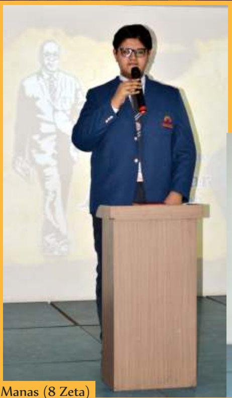
Manas (8 Zeta)