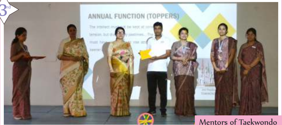
Mentors of Taekwondo