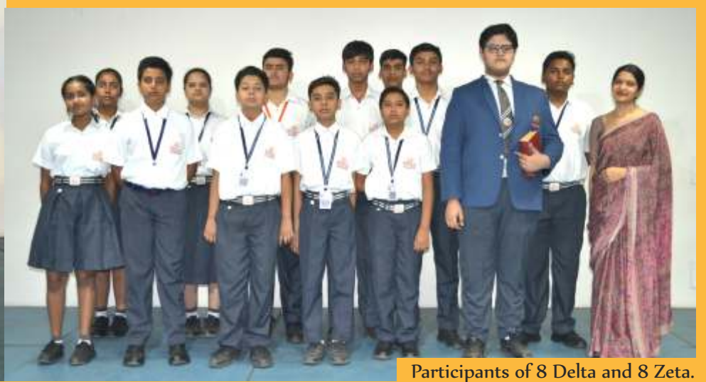
Participants of 8 Delta and 8 Zeta.

"Cultivation of mind should be the ultimate aim of human existence." - Dr. B.R. Ambedkar.