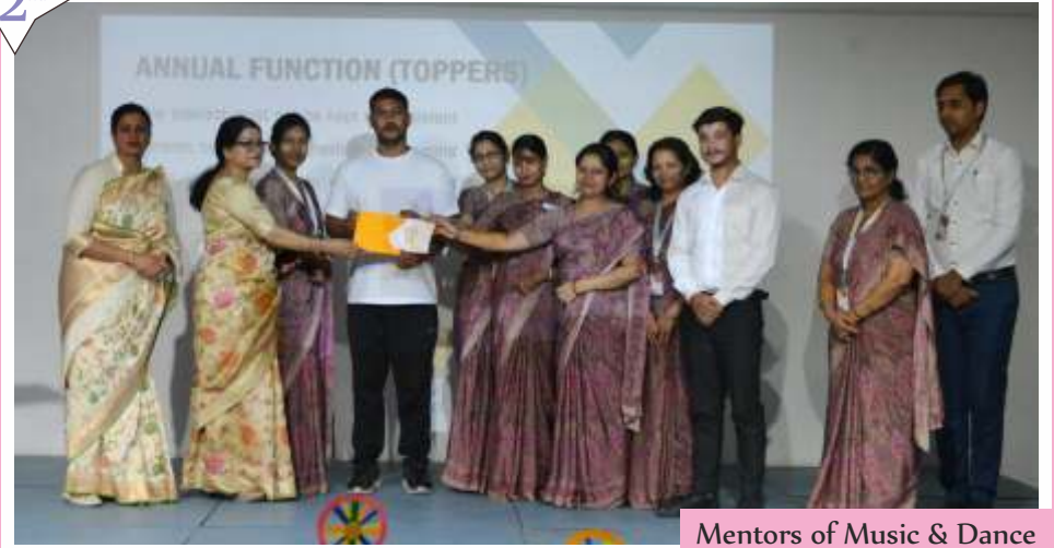
Mentors of Music & Dance