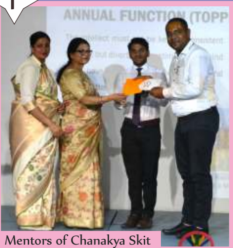
Mentors of Chanakya Skit

Appreciating people's efforts are the finest way to enhance their efficiency at work. Recognition of a person's efforts add up to his or her productivity.