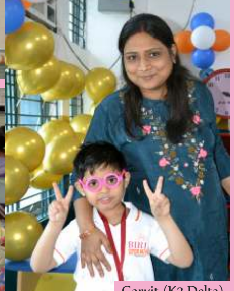
Garvit (K2 Delta)