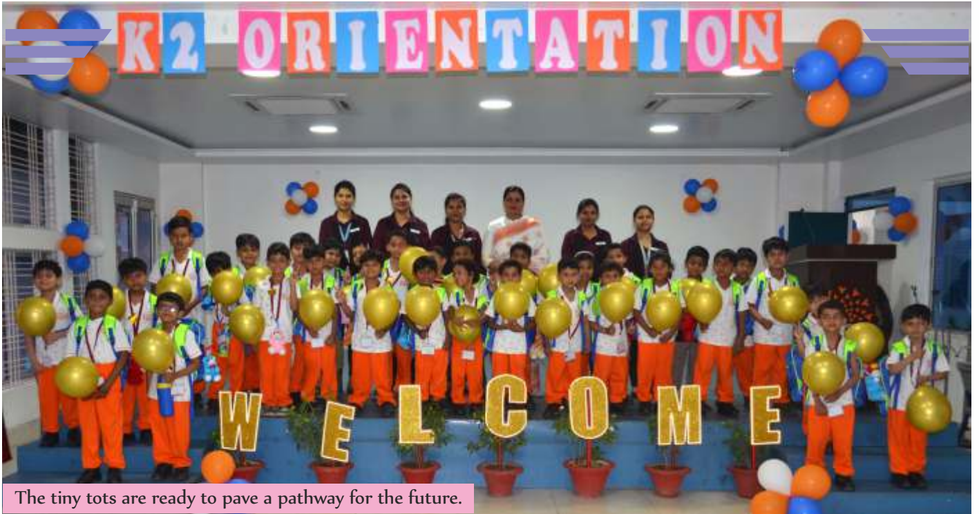
The tiny tots are ready to pave a pathway for the future.