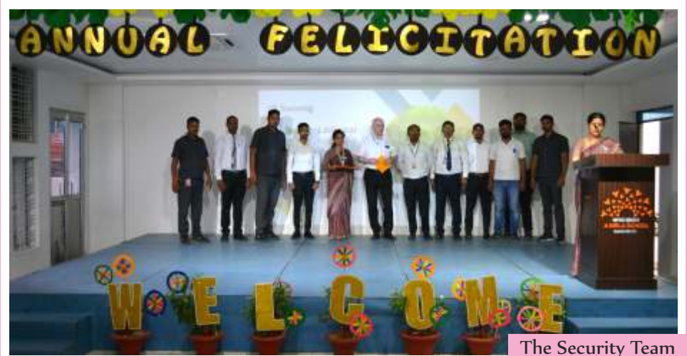
The Security Team

Keeping up with this philosophy, the school decided to identify its leaders in various fields by awarding them in cash and in kind. Certificates of recognition, badges for promotion and acknowledgement were conferred upon the individuals who had proved their mettle in the face of challenges on their work fronts. It was a joy to see the honoured faces beaming with pride and fulfilment.