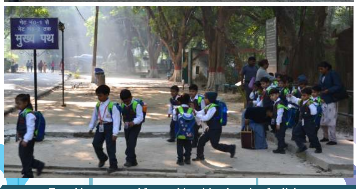
Travel is not reward for working, it's education for living.