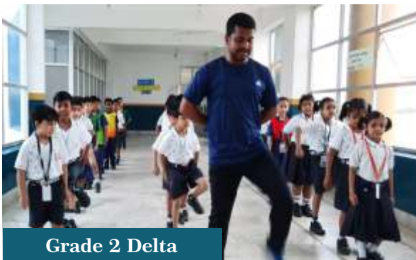
Grade 2 Delta