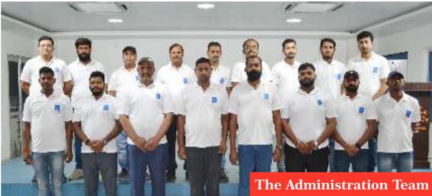
The Administration Team