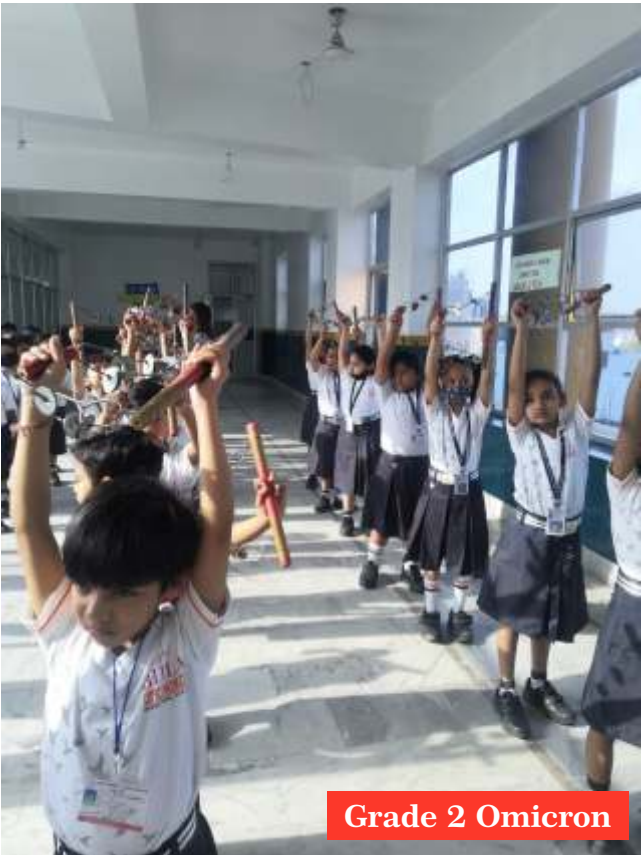
Grade 2 Omicron