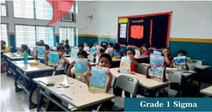
Grade 1 Sigma

It was awe inspiring to see a kaleidoscope of visual arts presented by our gingery students. There were pots, landscapes, cell presentations and lots more in the platter. Each brought out their adroit through the crafts prepared by them.