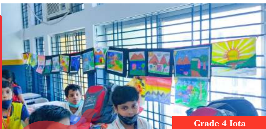
Grade 4 Iota