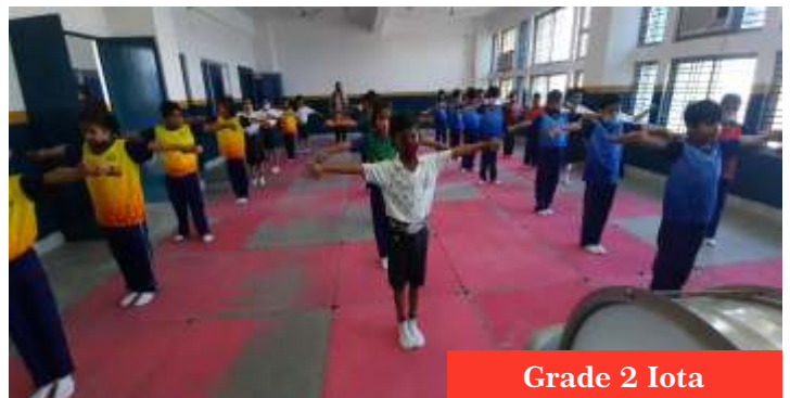
Grade 2 Iota