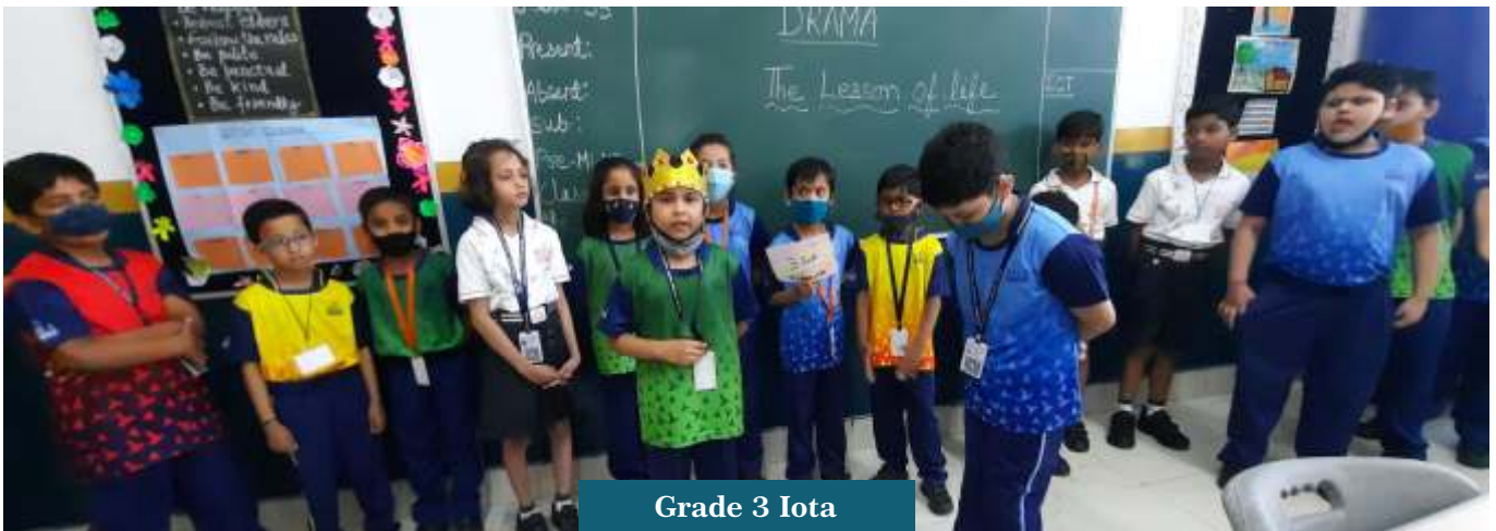
Grade 3 Iota