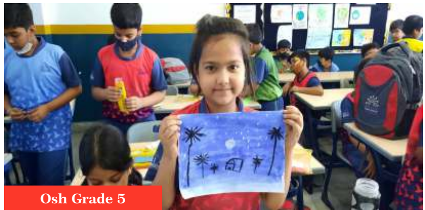
Osh Grade 5