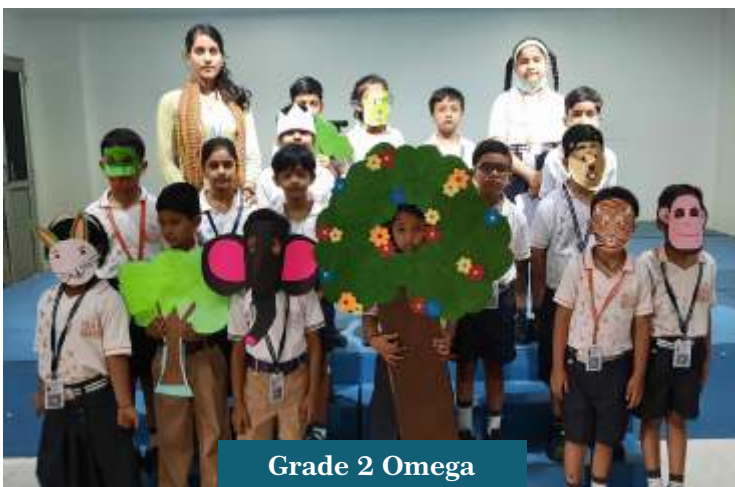
Grade 2 Omega