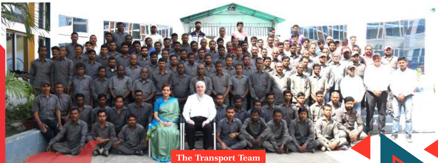
The Transport Team

“You are genuinely happy if you don’t know why.”