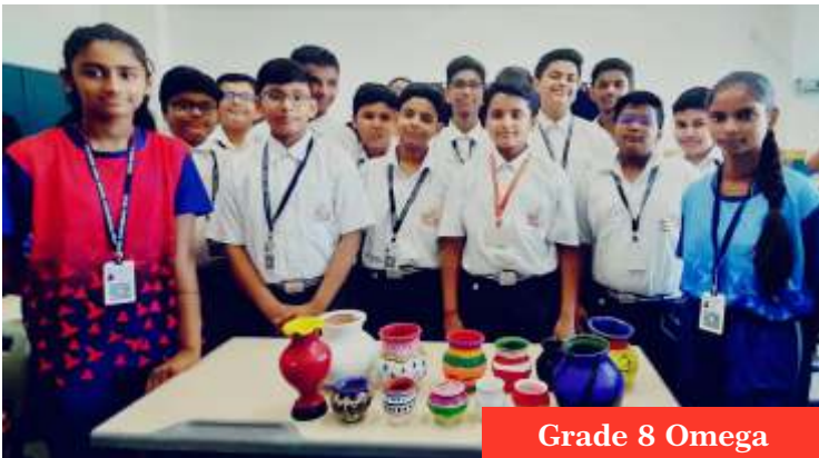
Grade 8 Omega