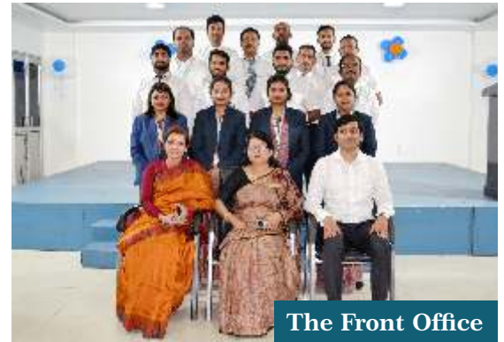
The Front Office