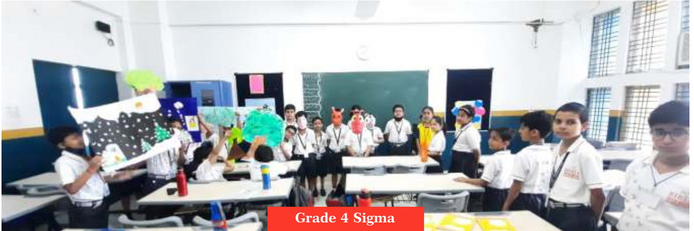
Grade 4 Sigma

It was an elfin to see the students across all grades to stage out dramas and plays. Starting from old folklore to Shakespeare we had it all on one footlight. The classes had conjured up with full of outgoing confident kids with their sight set on performing the best. The learning sessions empowered them with confidence to speak and perform.