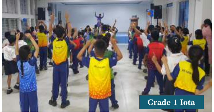
Grade 1 Iota