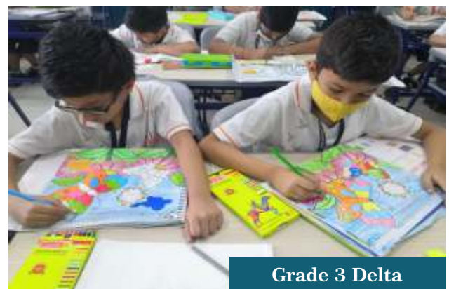
Grade 3 Delta