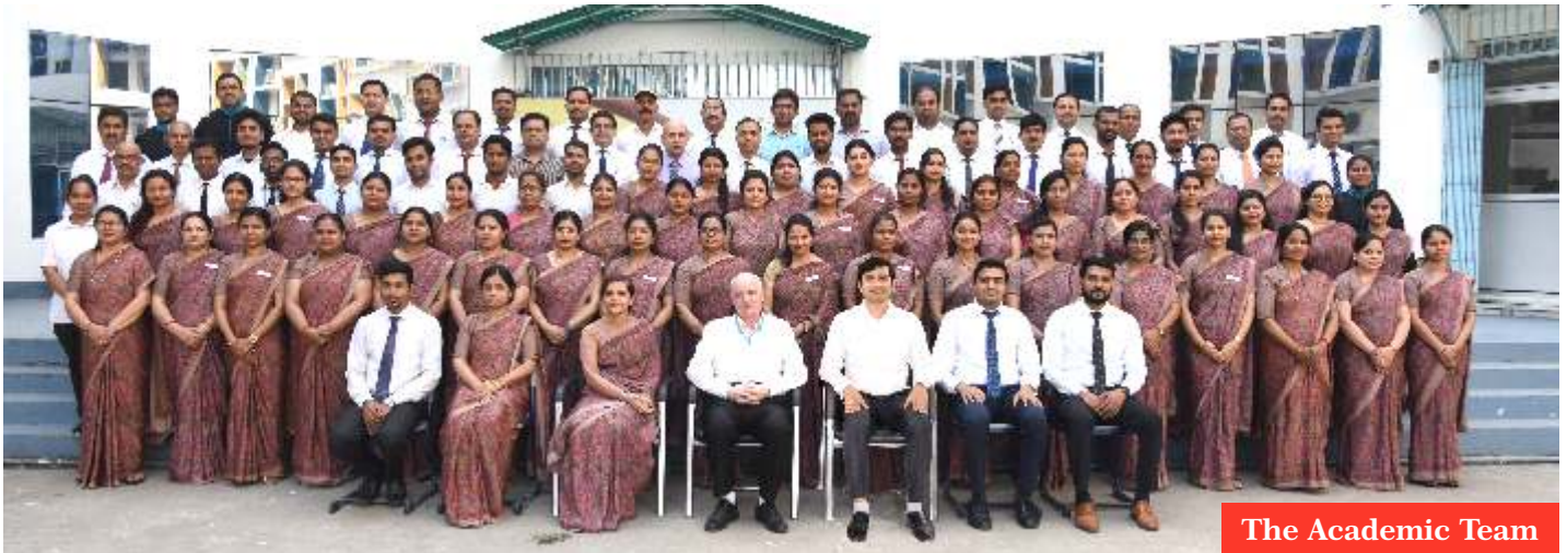
The Academic Team

We would like to express our gratitude and appreciation to the entire team for immaculately performing their duties. It always makes us feel proud to work with a team that is so efficient and motivated. The resilience and patience that our administrative team showed during the most turbulent times were commendable. The transport team displayed extraordinary energy level and sincerity in handling the challenges on their way in an exemplary manner. We also appreciate the tremendous amount of effort that all the faculty members have put in to accomplish each goal on time. Without the support of and the coordination among all the departments, the organization might not have achieved these milestones.