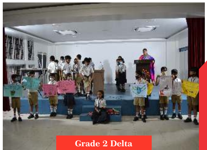
Grade 2 Delta

“The best way to predict the future is to create it.”