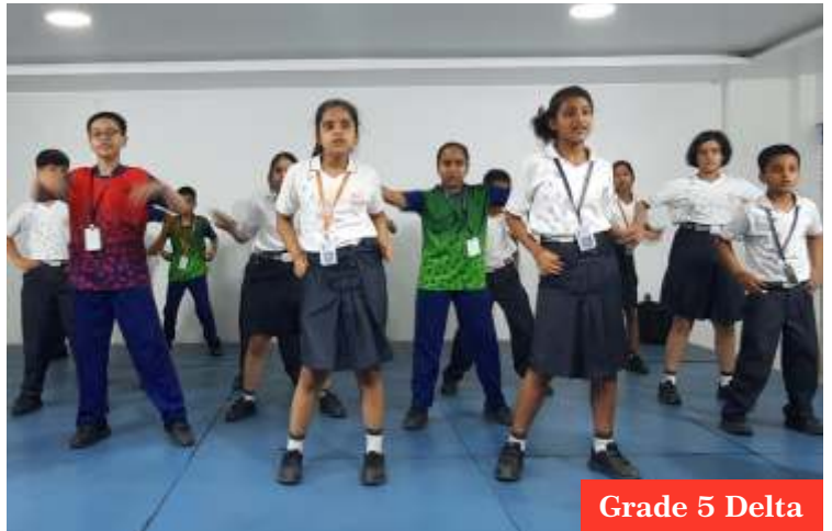
Grade 5 Delta