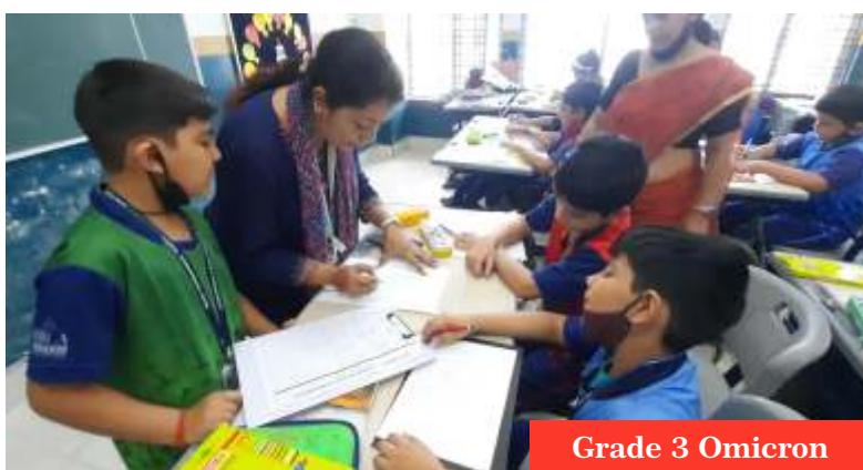
Grade 3 Omicron