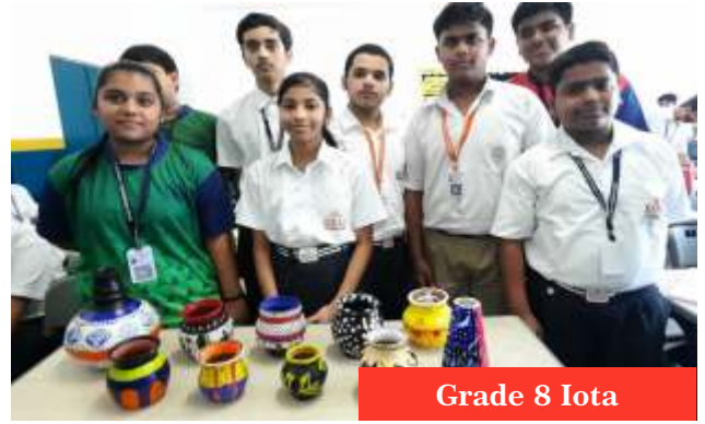
Grade 8 Iota