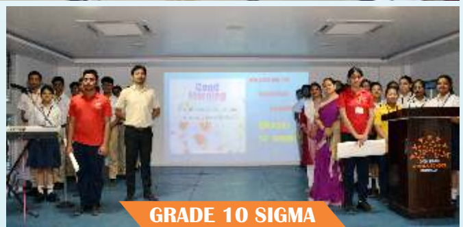
GRADE 10 SIGMA

The time is always right to do what is right