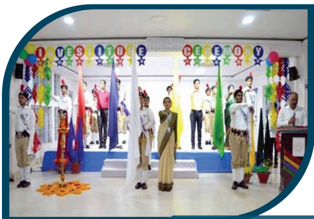
THE CHOSEN ONES!