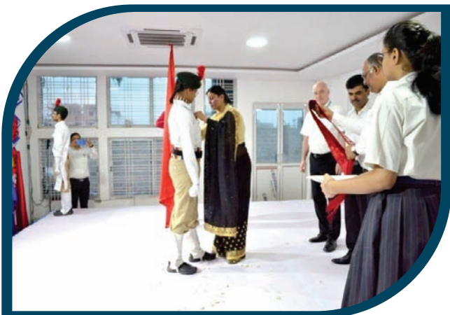
YES, I DO!