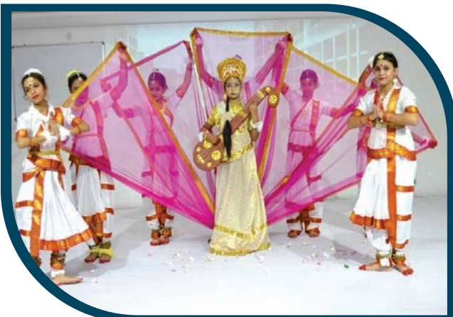
THE WELCOME TROUPE