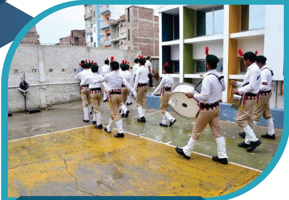
TAKING THE GUARD!