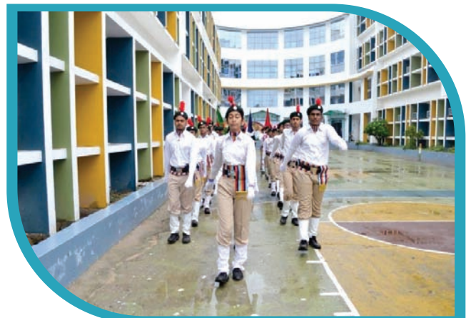
HEADING FOR RESPONSIBILITIES