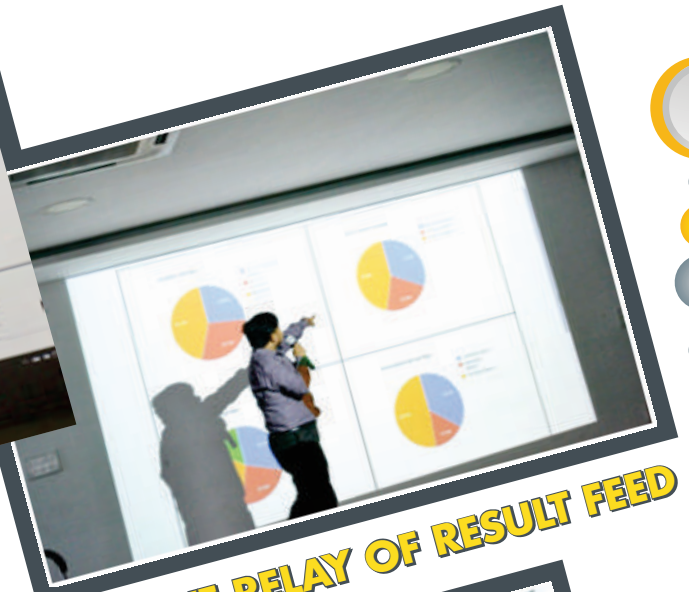
THE LIVE RELAY OF RESULT FEED