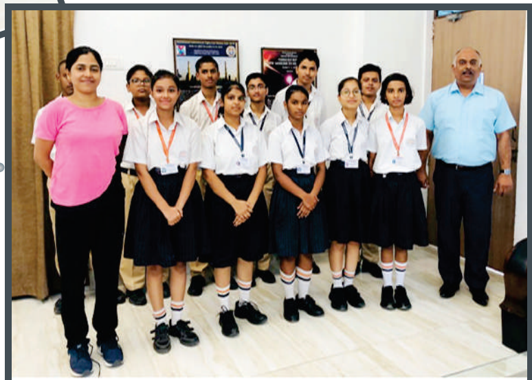
THE CHESS WIZARDS